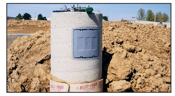
2. Remove form after concrete has been poured and allowed to cure.

J-Box, with all conduit and fittings placed as desired, is temporarily attached to the concrete form – base and lid inside.