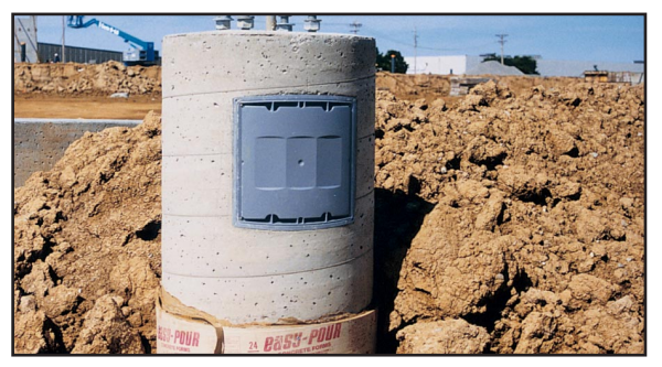
4. After wiring is completed, the lid is replaced to complete the installation.