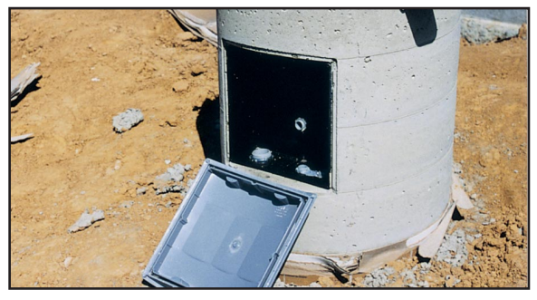
3. Pop off the J-Box lid, leaving an 8" x 8" x 4" or 12" x 12" x 4" access area, depending on the J-Box selected.